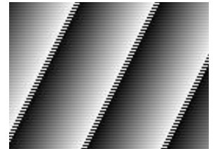
Raven synthetic camera output

Configure a Road Runner or an R3 for your camera